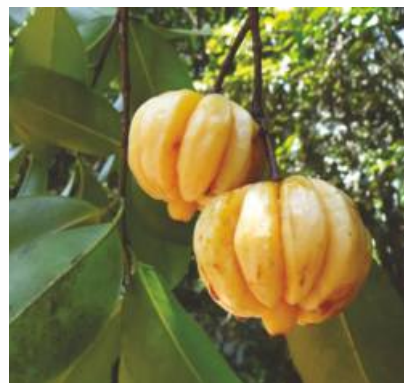
Garcinia Garcinia Cambogia